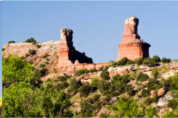
Palo Duro Canyon

The Texas Association of Legal Professionals and NALS of Amarillo Invite NALS Region 6 to Join Us in